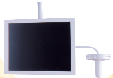
Optional LCD monitor